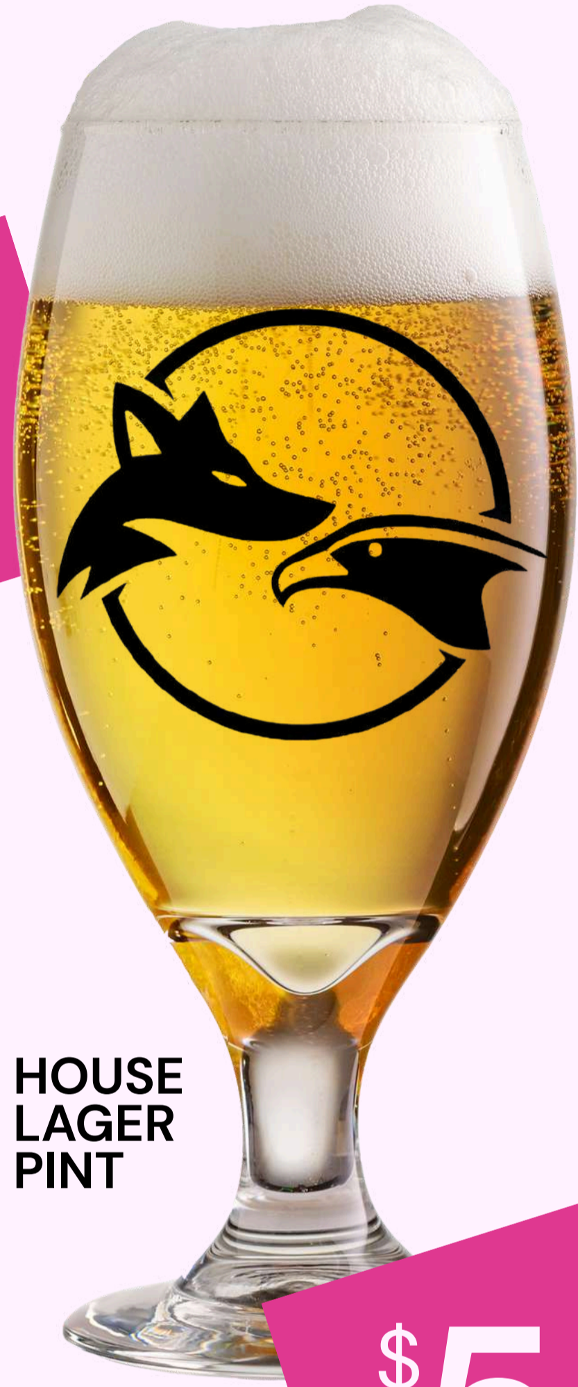
HOUSE LAGER PINT