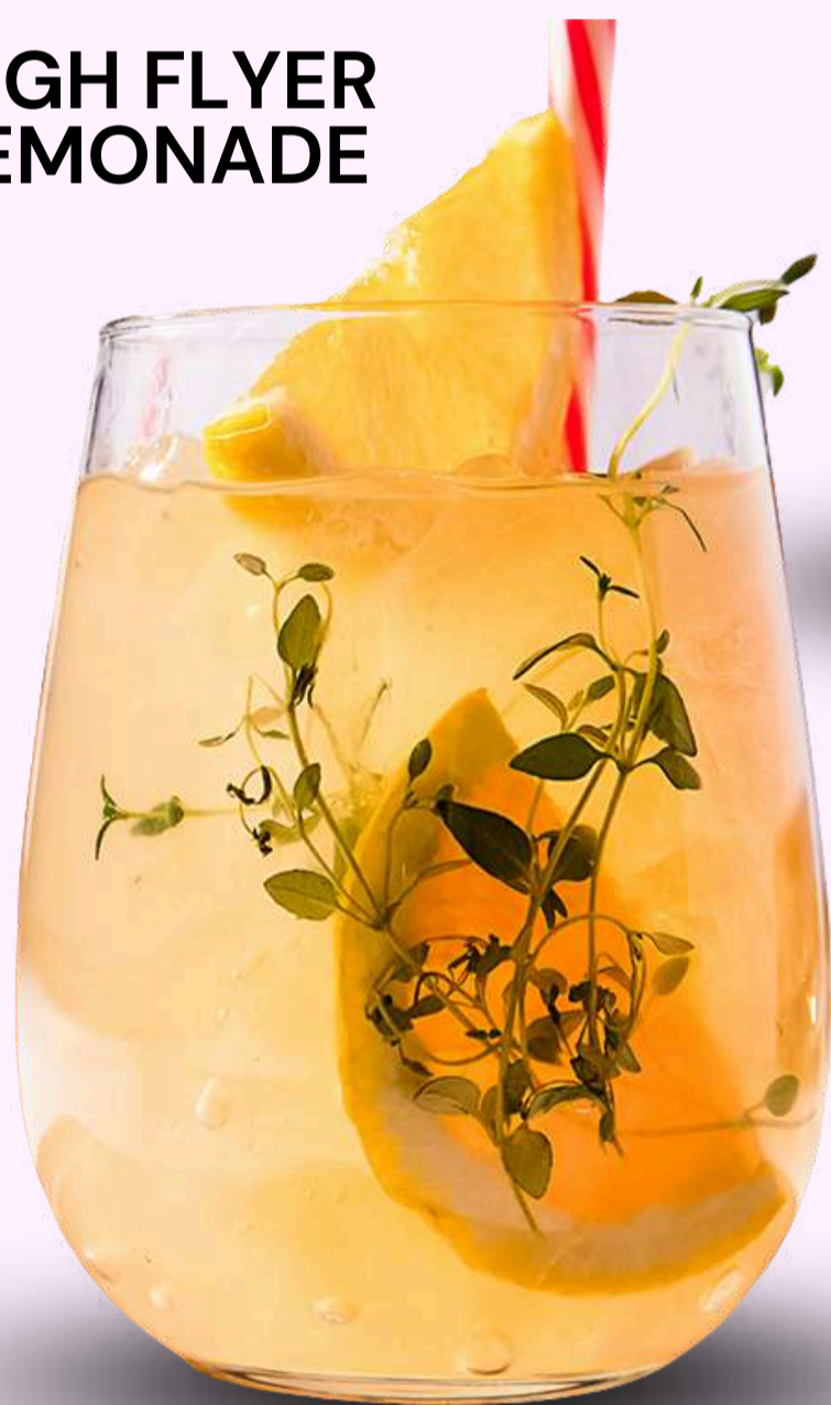
HIGH FLYER LEMONADE